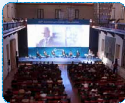
— The Sala Arazzi conference room in Fondazione Cini, where took place the workshop.

In order to celebrate its 60th anniversary, Stevanato Group organized a major event in Venice on the 29th of October.