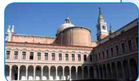
— Sala del Cenacolo, Fondazione Giorgio Cini, S. Giorgio Isle